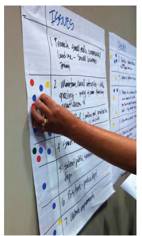
Prioritizing community issues at a public meeting.

Several very positive aspects of the makeup of the steering committee played out during the process. Having active members of the leadership of the board of supervisors was important. These individuals were able to guide the plan in a way that predicts the plan will be approved during the MPC adoption process. Including representatives of the township's planning commission, environmental advisory committee, business owners and school district was helpful in terms of discussing a wide range of topics. The consultant, in retrospect, feels it should have done more to include more women, younger people, stay-at-home parents and representatives of other demographic groups as members of the steering committee, to make it more representative of the community. A very diverse steering committee tends to create additional discussion and momentum.